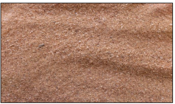
Figure 1: Quartzite Sand

Machine crushed finely graded quartzite sand obtained from locally available quartzite quarry (kothavalasa), is used in this investigation and its sample material is shown in the figure 1 and the Physical Properties of Quartzite Sand are presented in Table.1.